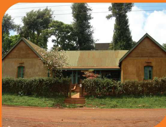
Meru Museum, Kenya. (Museum of East Anglian Life)

community assets. Both Meru and Stowmarket are agricultural centres, and their museums have collections of local cultural heritage and social history as well as live specimens (cattle, sheep and horses at MEAL, crocodiles, monkeys and snakes in Meru). MEAL is known for its work in supporting volunteering, training and skills development for vulnerable people whilst Meru Museum's gardens are used by local herbalists and act as a medical centre. The partnership shared knowledge to help establish social enterprises based around traditional horticulture. At MEAL, a small horticultural business was set up to develop skills in vulnerable adults, whilst Meru Museum developed programmes teaching traditional farming methods to orphans and vulnerable children and people living with HIV and AIDS to reduce dependency on food imports and the use of hybrid seeds. The two museums exchanged staff members during the period and shared expertise online. The MEAL/Meru programme illustrates the potential for partnerships based on resilience, sustainability and community development.