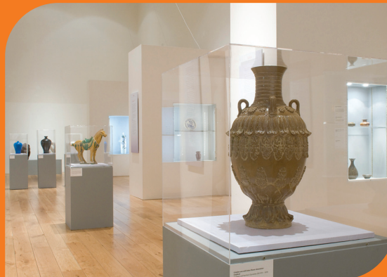
Celadon vase in the From the Realm of the Dragon exhibition at the Lightbox.