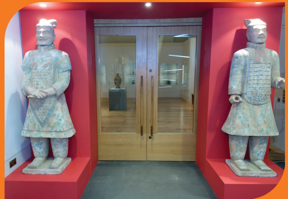
Entrance to the From the Realm of the Dragon exhibition at the Lightbox.

rewarding, both for The Lightbox staff, who broadened their understanding of the different approaches to historic items and curatorship in China, and the two Ceramics Museum curators who spent time in Woking setting up the exhibition, and being introduced to UK museum practice.