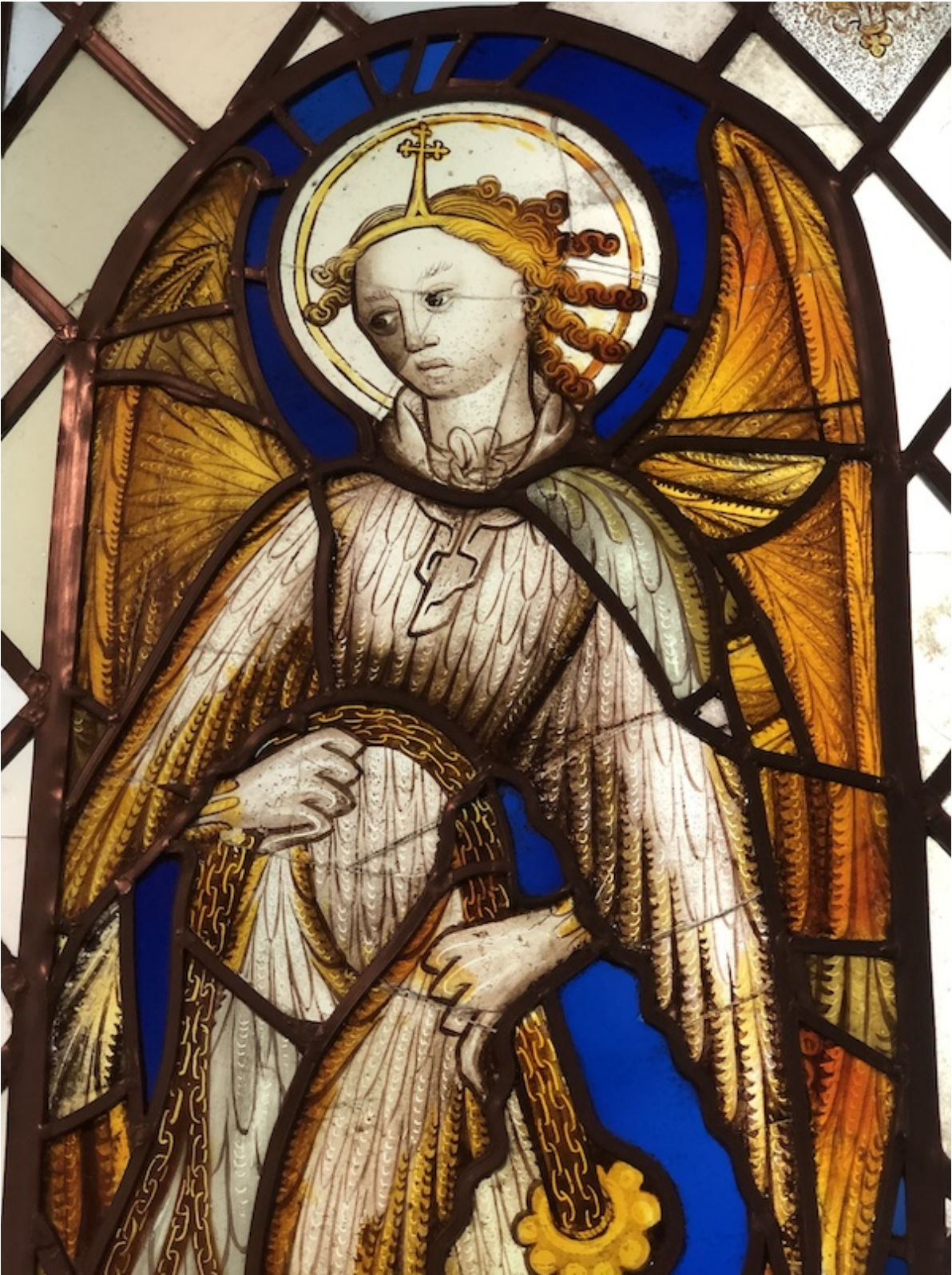
'Making Sense', 'Sight, 2' by Ruby, RAMM Youth Panel 2023.