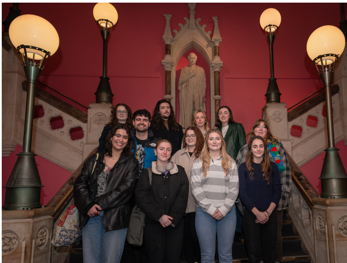
The RAMM Youth Panel

This year's Arts Marketing Association Conference will be held in Leeds from 12-14 July. The focus of the conference is 'Audiences at the Heart' and will include sessions on growing audience loyalty post-pandemic, decolonising arts brands and AI in arts marketing. There are 33 bursaries available to cover the full cost of the conference. Bursary application deadline is 19 May at 12.00pm. AMA