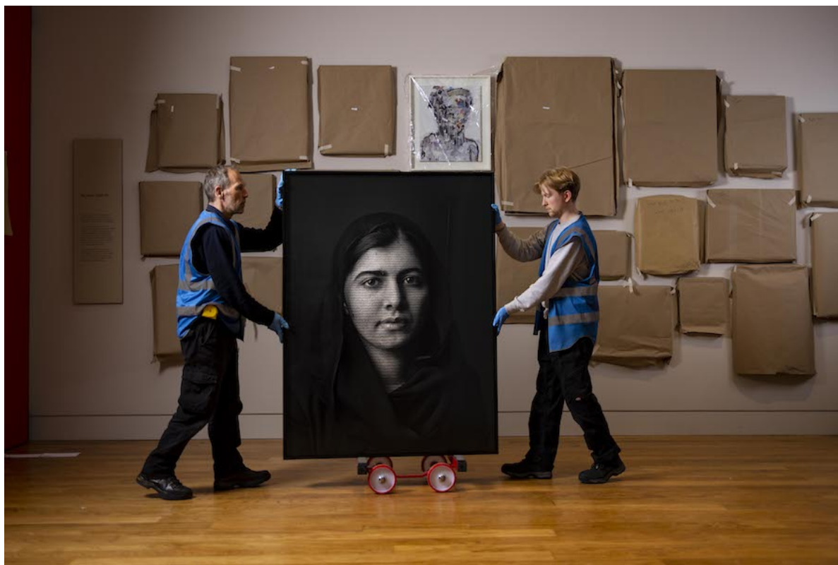
Portrait of Malala.