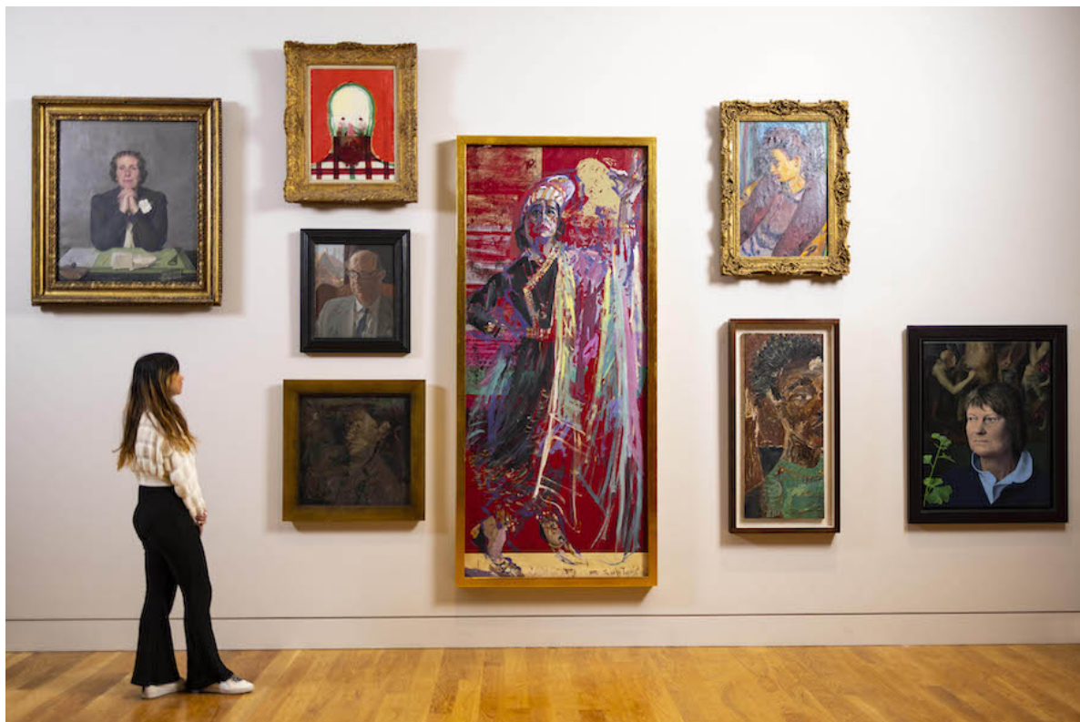
The National Portrait Gallery Opens on 22 June.

This year's CHWA Conference will run from 11-13th October in Barnsley. It is for people who are interested in creativity/ culture, health and wellbeing and working collectively to bring about social change. Titled 'Making Change', the conference will focus on the question: What now? What needs to happen at a personal, organisational, and political level to bring creativity and health together, and to break down the barriers that have separated them? Tickets go live in June. CHWA