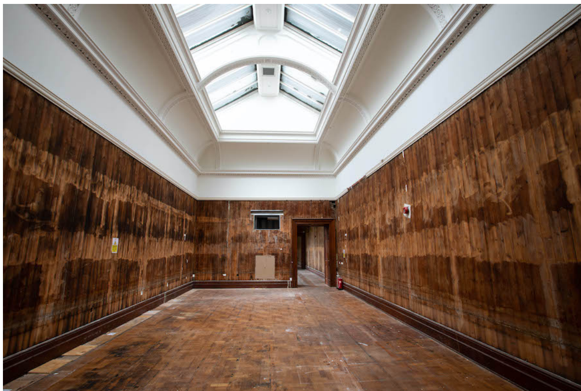
The Weston Wing, midway through redevelopment.