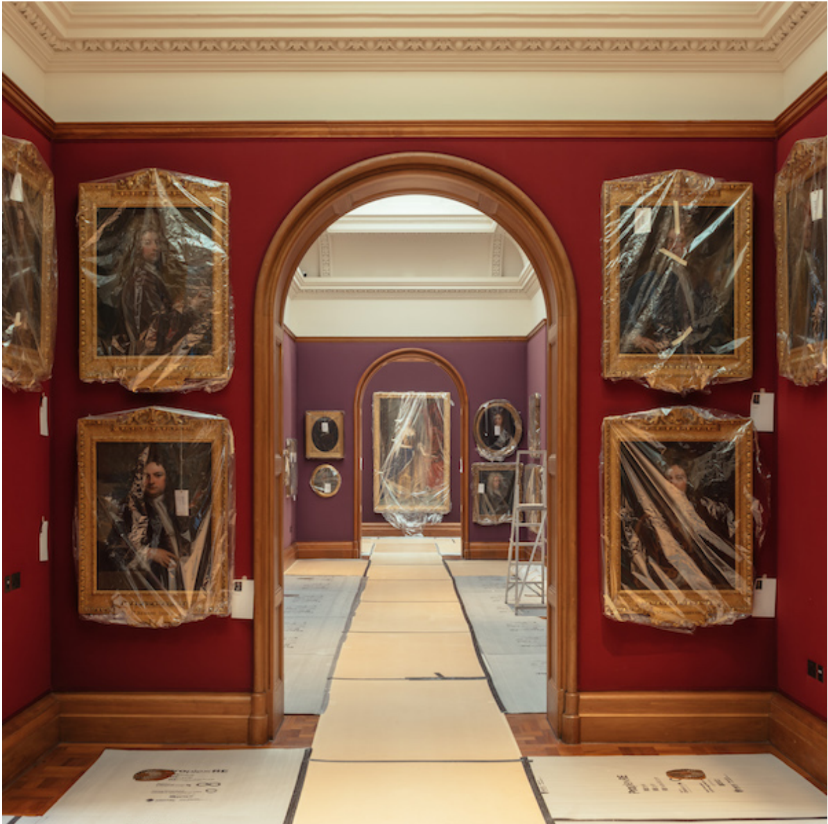
Third-floor galleries of 17th- and 18th-century works.

Rubber Cheese have opened this year's survey which aims to help attractions improve their digital infrastructure and enhance the visitor experience, moving from clicks to conversions. The report will include a comprehensive analysis of the latest benchmarks and trends, as well as practical solutions. The survey is open to all marketing professionals, managers and digital professionals in the visitor attraction sector. The survey is available to access until the end of July with the report due in September. Rubber Cheese