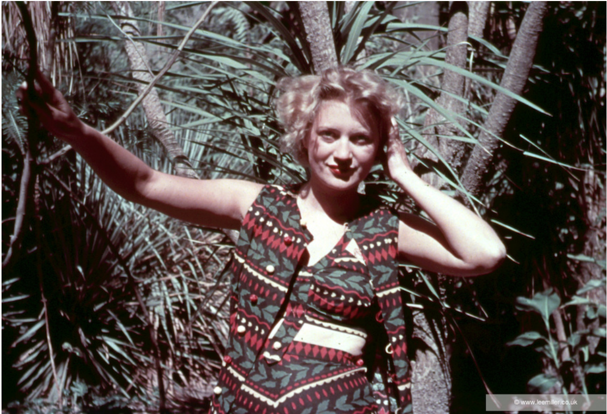
Lee Miller, Mougins, France 1937 by Roland Penrose Brighton & Hove Museums - Lee Miller: Dressed.