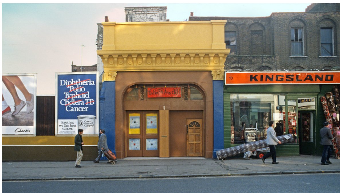
Exterior of the Four Aces, London. 'Beyond the Bassline: 500 years of Black British Music', British Library.