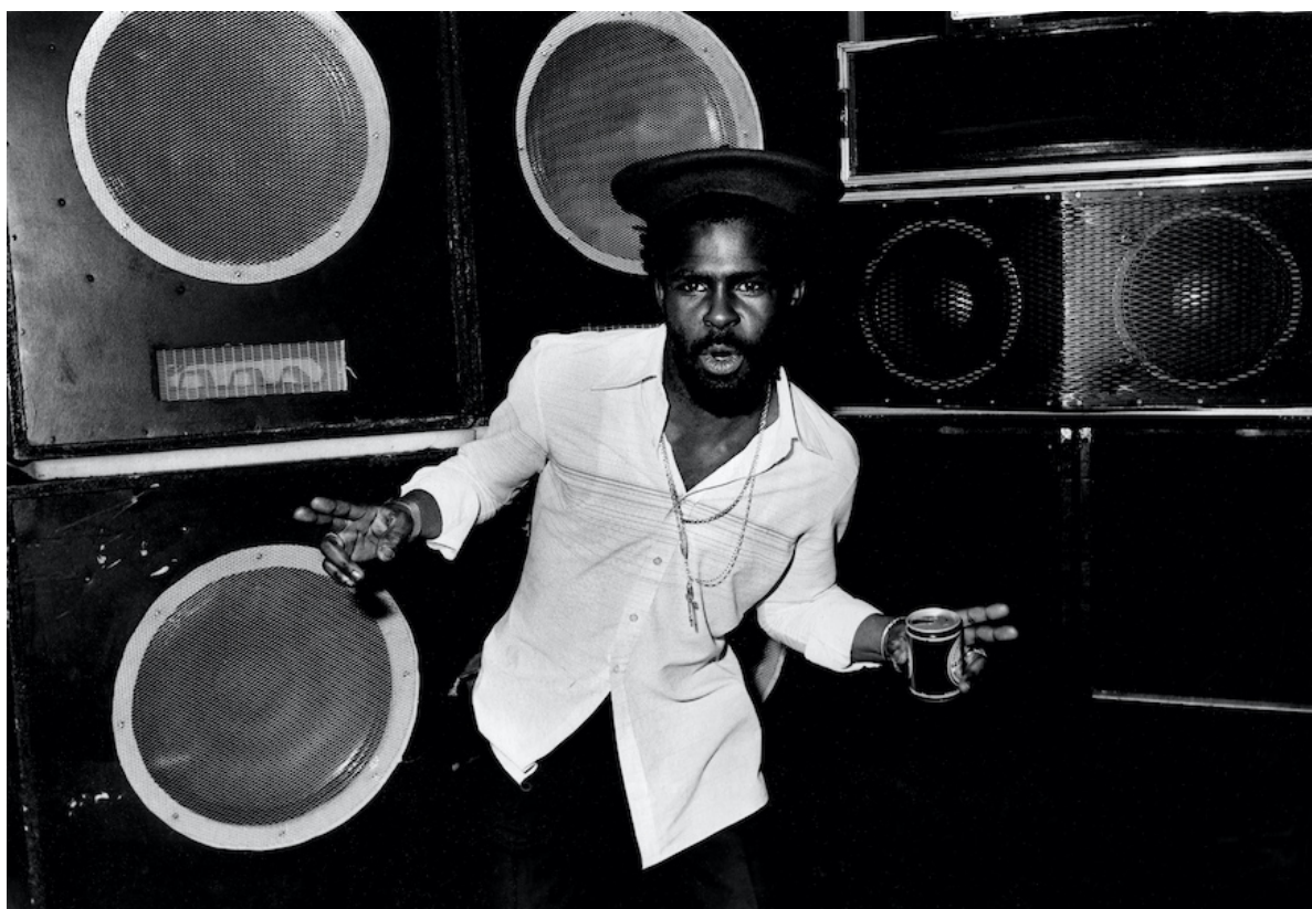
Dancing, holding can of Guinness, in front of speakers, 1983. 'Beyond the Bassline: 500 years of Black British Music', British Library.

Also: 'I've never heard a Labour leader speak about the arts like Kier Starmer – now I hope words become actions', Guardian