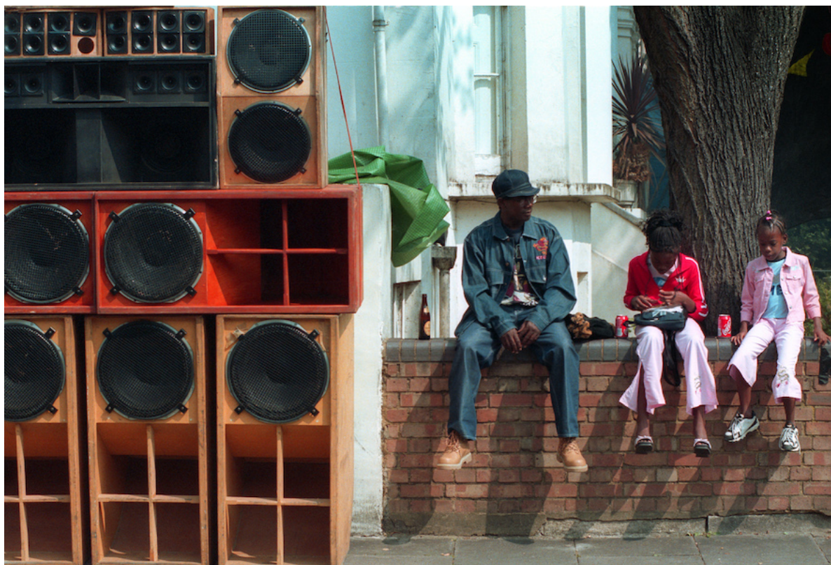
Notting Hill Carnival. 'Beyond the Bassline: 500 years of Black British Music', British Library.

Section headings | NMDC news | Members' news | Government news | Election build-up | Sector news and reports | Visitor and income statistics | Cultural funding cuts | Climate crisis | Collections and restitution | Funding news | Funding opportunities | Professional development | Awards | Conferences and events | Call for papers | Obituaries | Openings | Appointments | Catch up | International news | Jobs